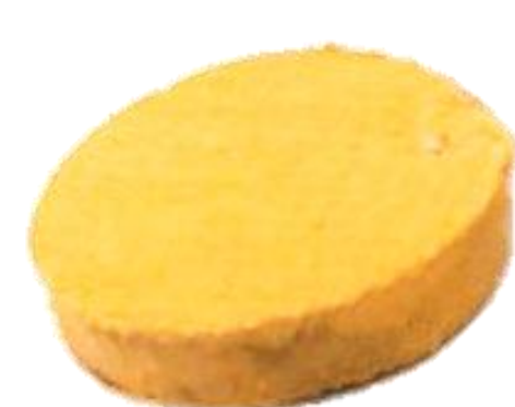
Fig. 3 Polyblend boot material