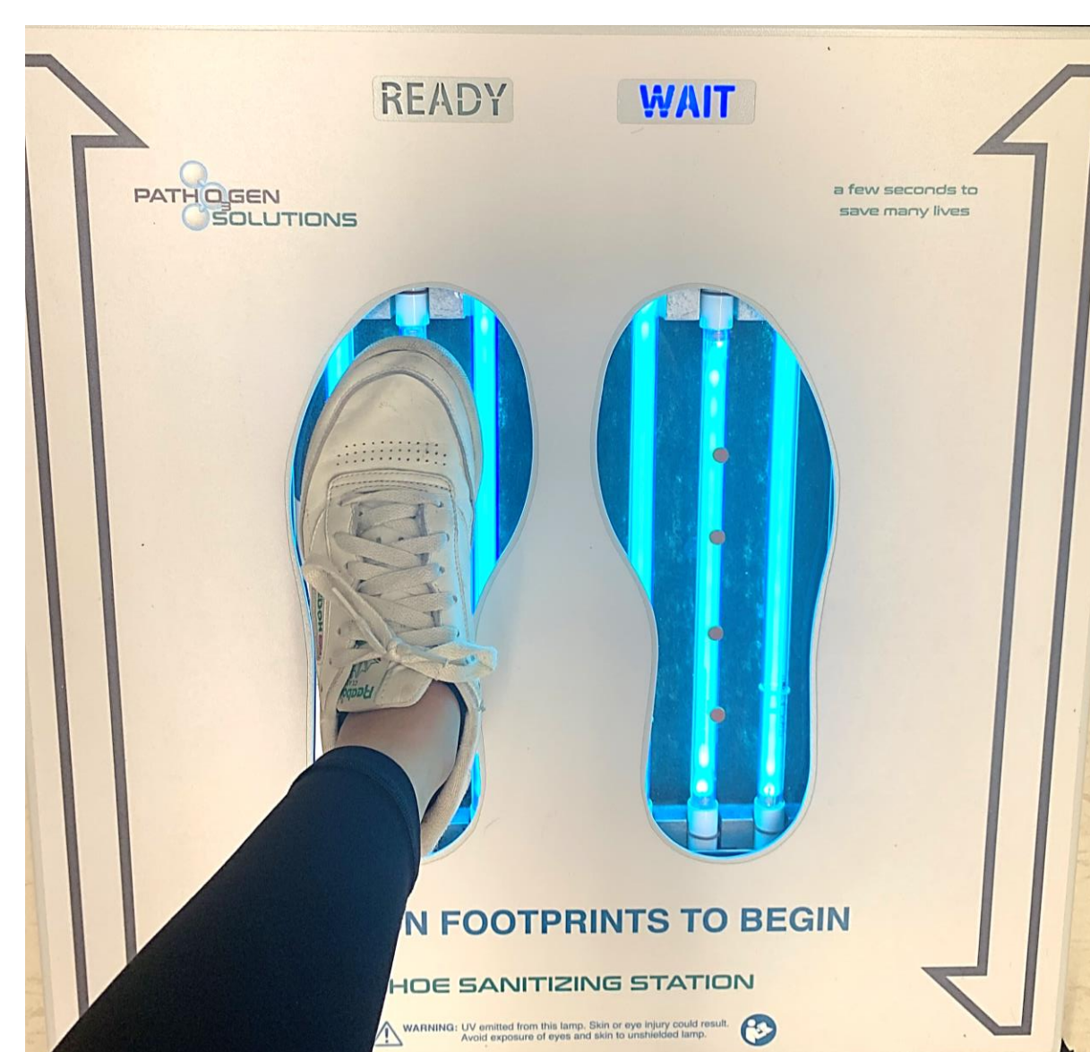
Fig. 5 BioSec with treated coupons