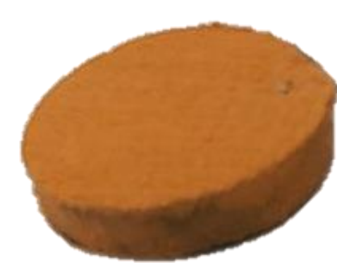
Fig. 2 Rubber sole material

Materials tested: Rubber sole (Fig. 2) and Polyblend boot material (Fig. 3).