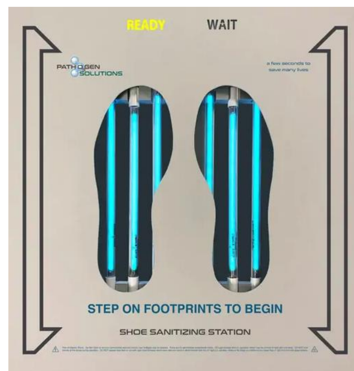
Fig. 1 BioSec, shoe-sanitizing station