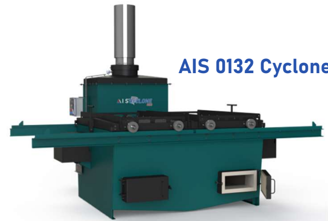
AIS 0132 Cyclone