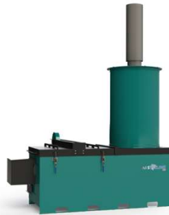
AIS 025 Cyclone