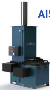
AIS 09 Cyclone

"Top loading, Front loading, Compact, Large Capacity, High Burn-Rate; Whatever size or type of operation you have, we have it covered with our comprehensive range of incinerators"