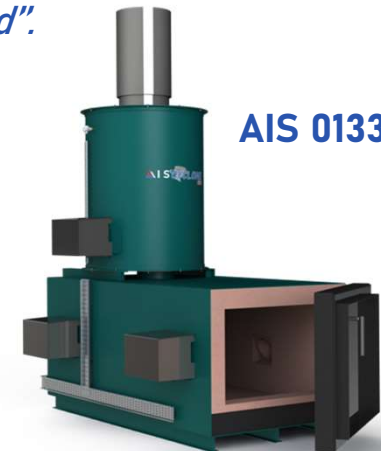
AIS 0133 Cyclone