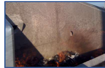
Internal main chamber view, waste being incinerated