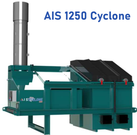
AIS 1250 Cyclone