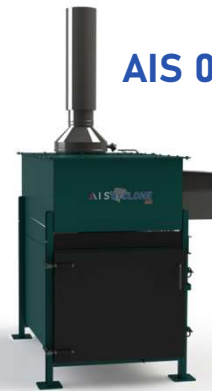
AIS 041 Cyclone