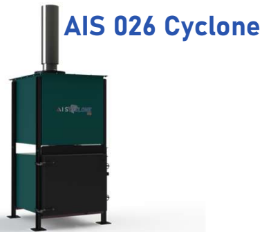
AIS 026 Cyclone

"Looking for a front-loading incinerator design? We have these three in our range for you to consider. Whatever size of operation you have, we have it covered".