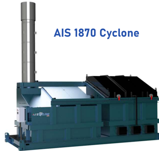
AIS 1870 Cyclone