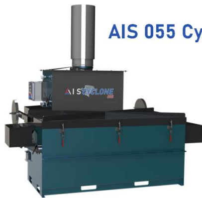
AIS 055 Cyclone