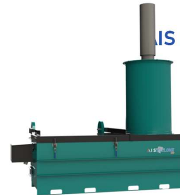
AIS 033 Cyclone