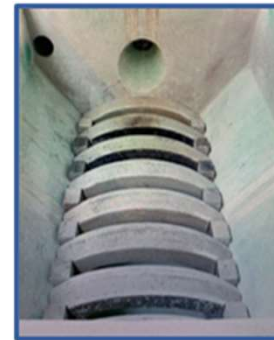
Unique Grate Bar system

•Can be loaded whilst in operation maximizing the inherent thermal efficiency of our monolithic concrete lining, keeping running costs low.