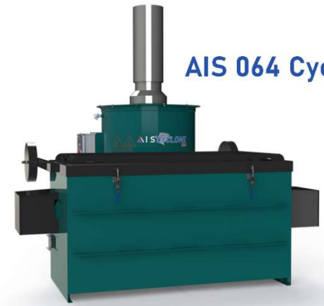
AIS 064 Cyclone